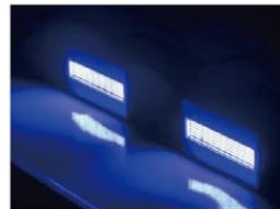
LED水冷固化灯 LED UV water- cooling Lamp