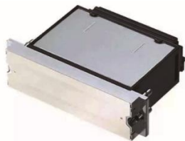
理光G6工业喷头 Ricoh Gen6 Printhead