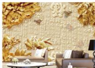
竹木纤维板 Bamboo fiberboard