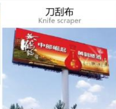
刀刮布 Knife scraper