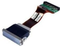
理光G5工业喷头 Ricoh Gen5 printhead