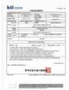
Bio Compatibility Test Report