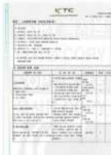
Safety Test Report