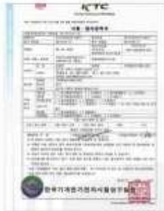
EMC Test Report