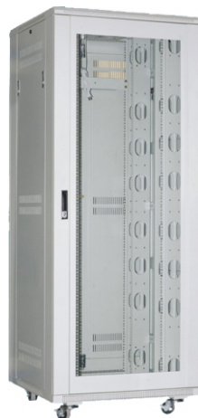
With cable manager