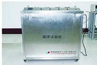
End Quench Test Apparatus 端淬试验机