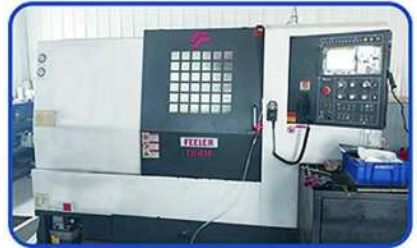
Slant Rail Horizontal CNC Lathe 斜轨卧式数控车床