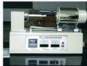
Vacuum Dilatometer 真空卧式膨胀仪

JYG Casting, A Precision Casting Specialist Always at Your Service! 景阳铸造, 您身边的精密铸造专家!