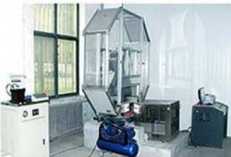
Low-temperature Impact Tester 低温冲击试验机