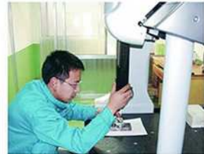
3D CMM 三坐标检测仪