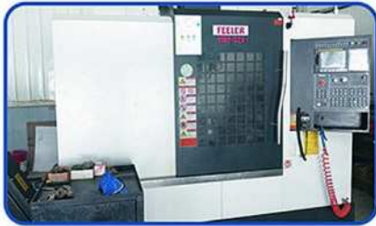
4-Axis Vertical CNC Machining Center 四轴立式加工中心

生产单重: 硅溶胶精密铸造: 10克到120公斤 壳模铸造: 5公斤到150公斤 表面粗糙度: Ra3.2-6.2 铸造公差: 根据ISO 8062 CT6标准。