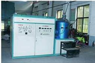
Vacuum Furnace 真空实验炉