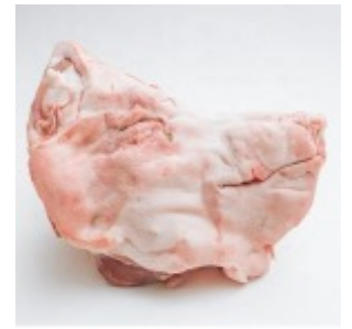
Frozen Pork Head Code: 1020925