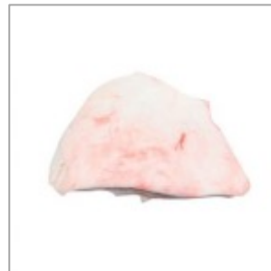
Frozen Pork Jowl Meat Skin Off Code: 1022513