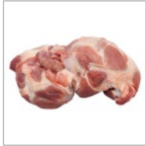
Frozen Pork Leg Boneless Code: 1021263