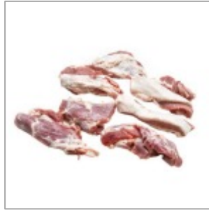
Frozen Pork Trimming 80/20 Code: 1021237