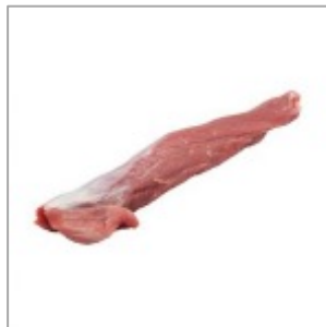
Frozen Pork Tenderloin (German Specification) Code: 1020853