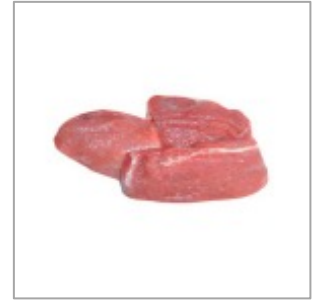
Frozen Pork Trimming 90/10 Code: 1022654