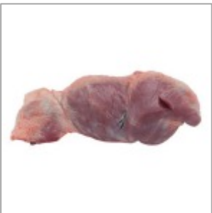
Frozen Pork heart Code: 1021903