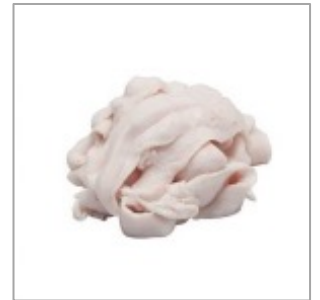
Frozen Pork Shoulder CuttingFat Code: 1022588