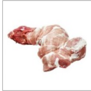
Frozen Pork Leg Boneless (European specification) Code: 1022145