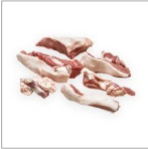
Frozen Pork Trimming 70/30 Code: 1021500