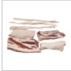
Frozen Pork Cutting Back Fat Code: 1021435