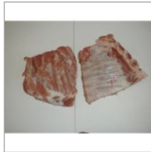
Frozen Pork Ribs Code: 1021265