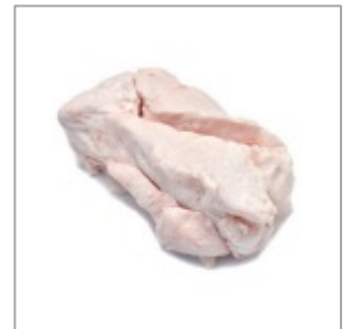
Frozen Pork Leaf Lard Code: 1022383