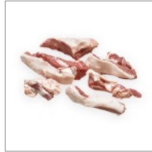
Frozen Pork Trimming 85/15 Code: 1021550