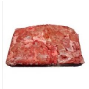
Frozen Pork Pancreas Code: 1022304