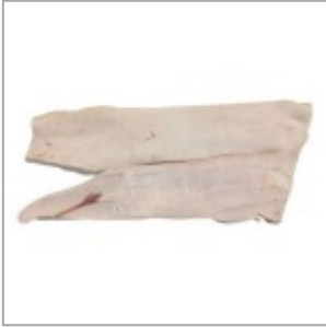
Frozen Pork Back Fat Code: 1021287