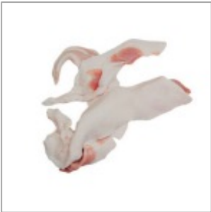
Frozen Pork Cutting Fat Small Code: 1022500