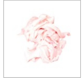
Frozen Pork Cutting Fat Code: 1021474