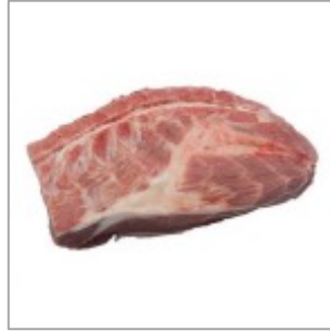
Frozen Pork Collar Bone In Code: 1022254