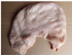
Frozen Pork Viscera Code: 1020927