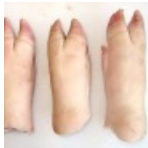
Frozen Pork Feet Fore-Hind Code: 1020922