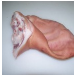
Frozen Pork Ears Code: 1020930