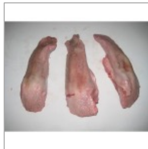
Frozen Pork Tongue Code: 1020924