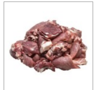
Frozen Pork Trimming 60/40 Code: 1022247