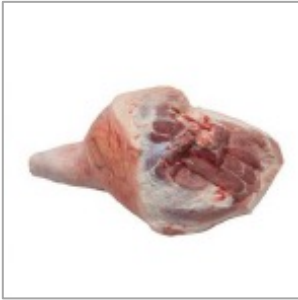
Frozen Pork Leg Bone In Code: 1020921