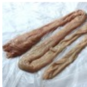
Frozen Pork Intestines Code: 1020929