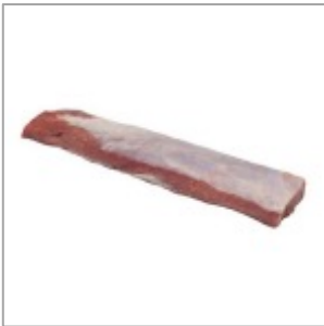
Frozen Pork Loin Boneless Code: 1021819