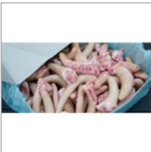
Frozen Pork Tail Code: 1020923