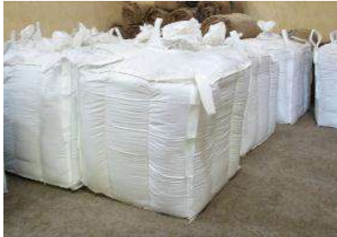
1 MT Jumbo Bag

Special packaging for Middle East : Mouda packing with corner stitching and roping