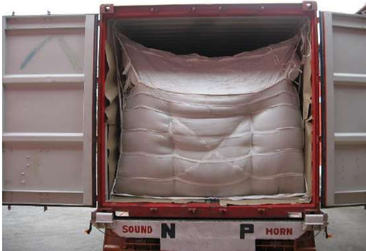
21 MT Jumbo Bag