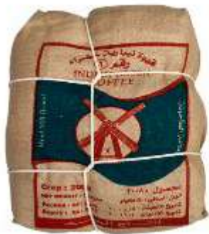
Mouda Packs with Corner Stitching & Roping