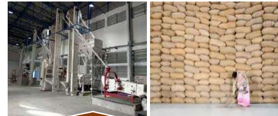
Curing & Storing

Well monitored and precise processing & storage