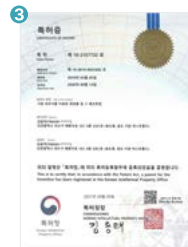
3 Manufacturer's patents for color change technology