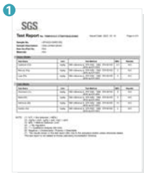
1 SGS safety test has been done