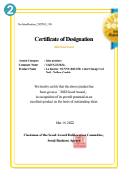
2 2022 Seoul Award for 'Idea Product'