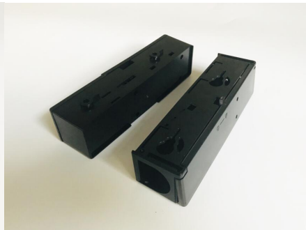
Humane Plastic Rat Rodent Control Catcher Trap Electric Mouse Killer