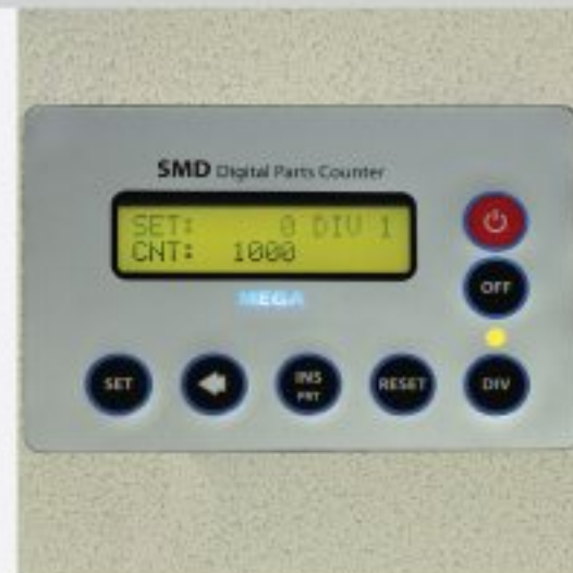
Simple Operation Keys