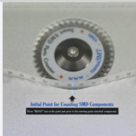
Initial Point for counting SMD components