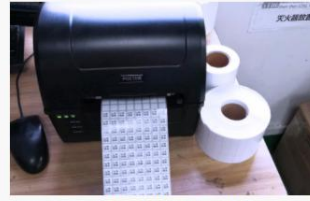
Labeling (date, SN number, QR code...)