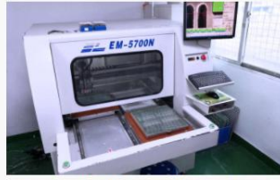
Separate PCBA Panel with Stamp Holes