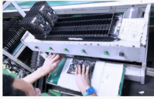
Seperate PCBA Panel with V-cut