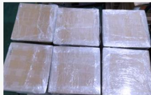
Cartons Packed by Wrapping Film