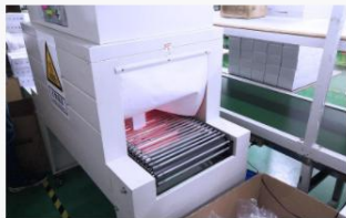
Sealing Packing for Finished Products