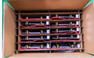
Packing with ESD Sheet & Cardboard