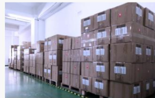
Shipment by Sea / Air / Express