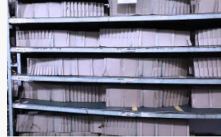
Various Size Cardboard in Stock