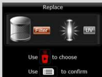
Replace Filter or UV