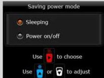
Power Saving Mode