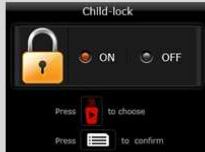
Child Protect Mode