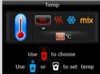
Adjust Hot Water Temp.