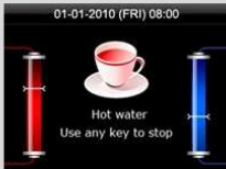
Get Hot Water